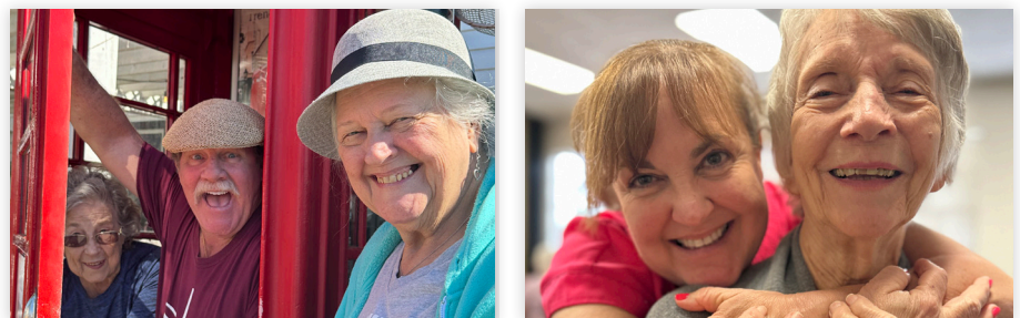
PICTURED ABOVE: Feb. Senior Outing - Mount Dora Art Festival, February Conway Community Market | February Senior Luncheon

“The righteous flourish like the palm tree...they still bear fruit in old age; they are ever full of sap and green, to declare that the LORD is upright; He is my Rock.” Psalm 92:12-15