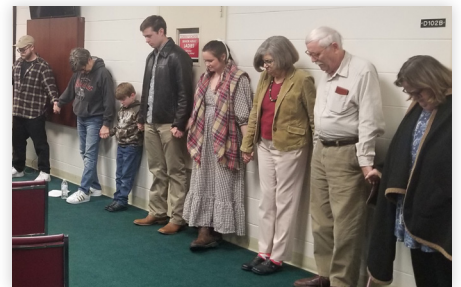
PICTURED ABOVE: Taco Sunday Social - January 7, 2024 Read Through the Bible presentation | January Business Meeting

“The righteous flourish like the palm tree...they still bear fruit in old age; they are ever full of sap and green, to declare that the LORD is upright; He is my Rock.” Psalm 92:12-15