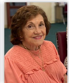
PICTURED ABOVE: SENIOR ADULT THIRD THURSDAY (MAY) LUNCHEON and SENIOR ADULTS TRIP to the DOWNTOWN LIBRARY - Thursday, May 4th

"The righteous flourish like the palm tree...they still bear fruit in old age; they are ever full of sap and green, to declare that the LORD is upright; He is my Rock." Psalm 92:12-15