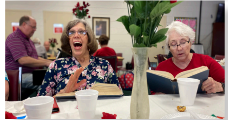
Third Thursday Lunch 2/17/22