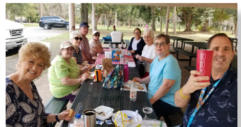
Mead Gardens Picnic 2/26/22